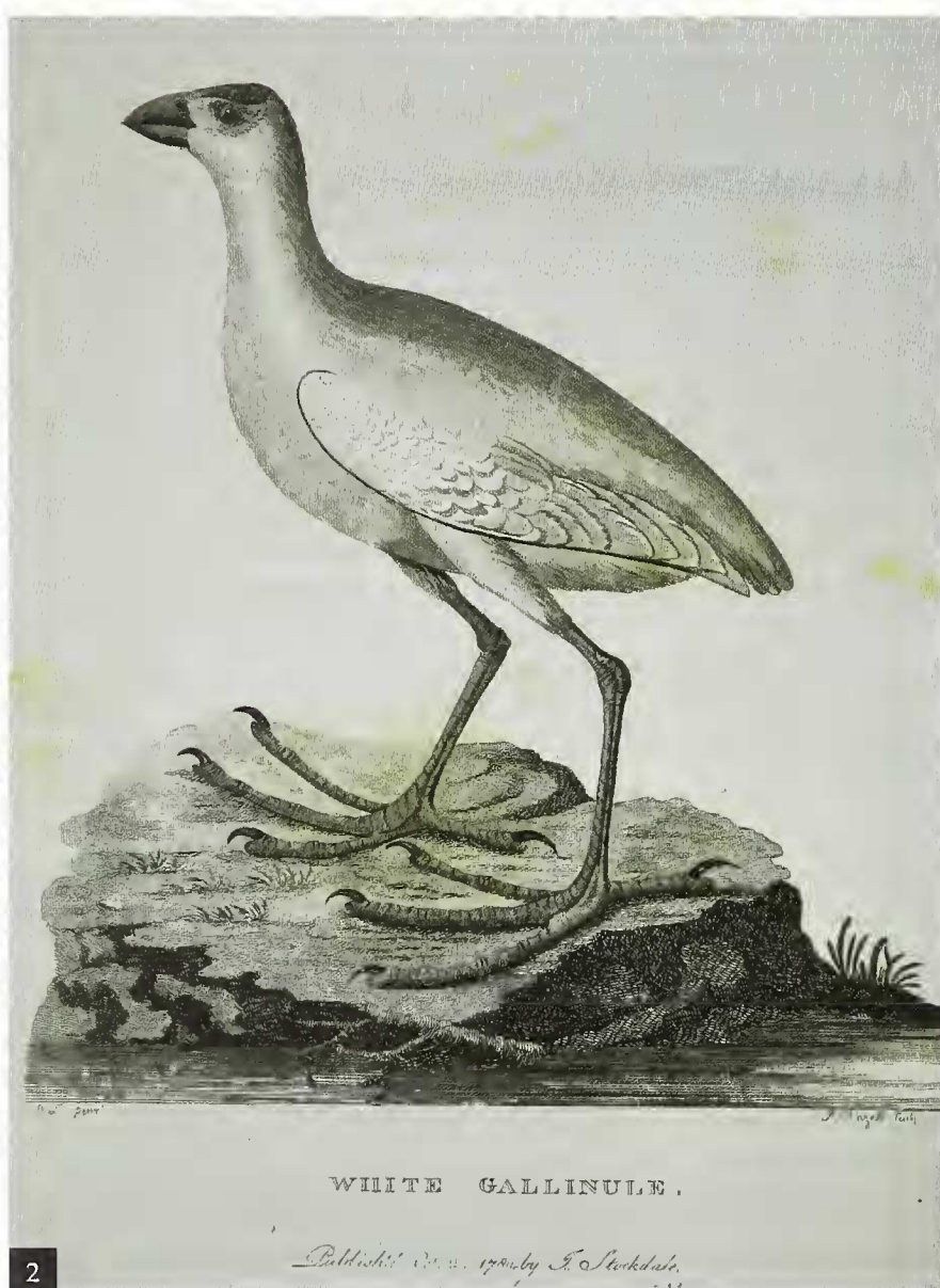
Figure 2. White Gallinule, pl. 44 in Phillip (1789), probably based on a live specimen